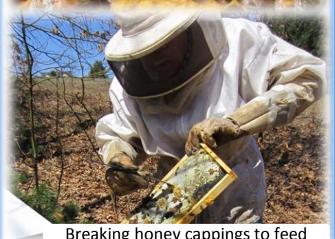
Breaking honey cappings to feed