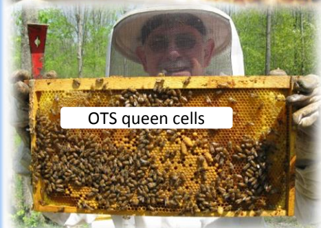
OTS queen cells