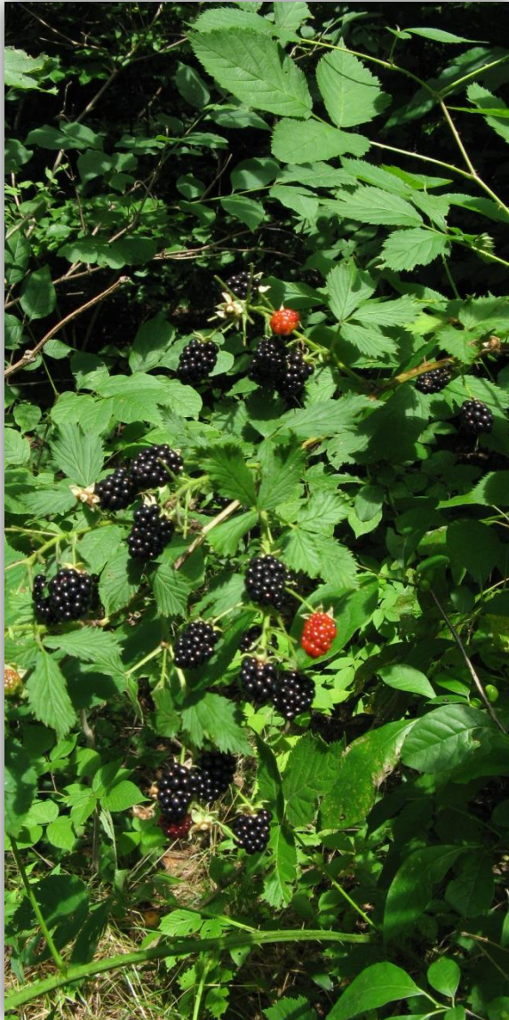
Pictured above: Wild blackberries pollinated by honeybees