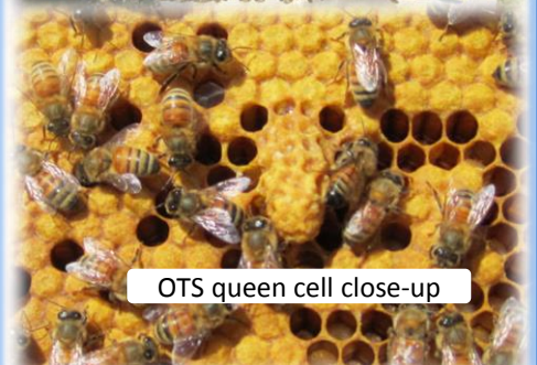
OTS queen cell close-up