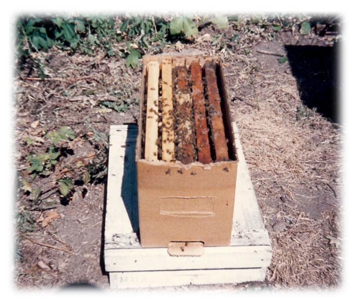
Figure 4 : The Splitter Nuc Box