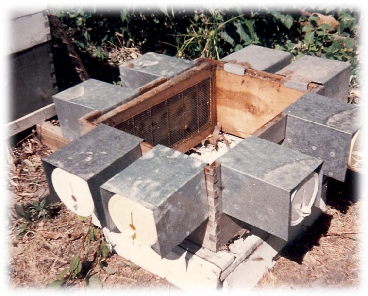
Figure 8 : The International Mating Nuc