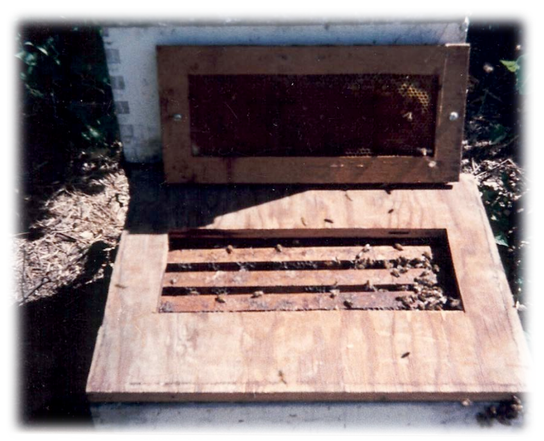
<u>Figure 6</u> : Inner cover for split-frame insert