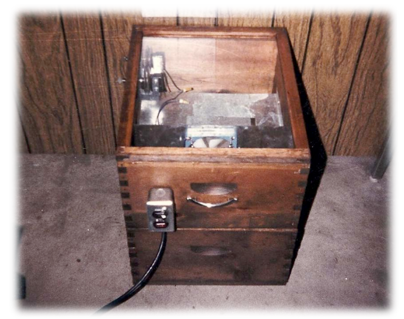
Figure 7: The incubator