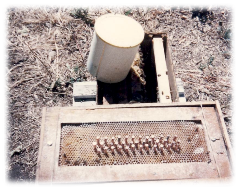
Figure 5: Bullets