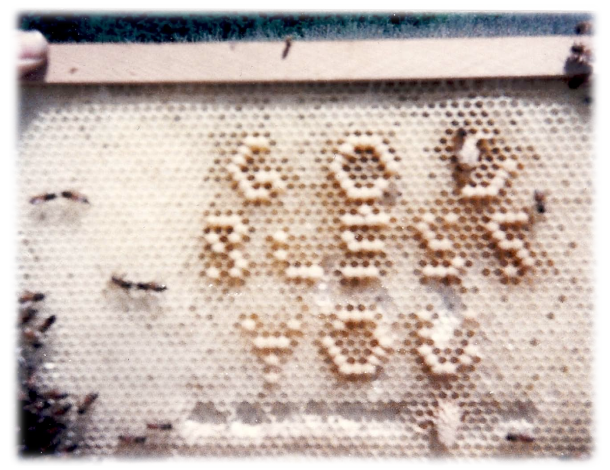
Figure 9: Message