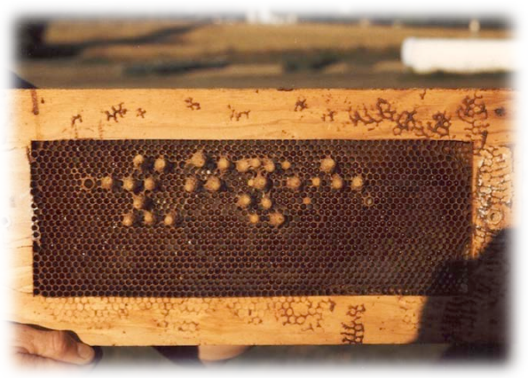
Figure 1 : Case-Hopkins method on split frame insert. Twenty-four excellent cells

In the Case-Hopkins method when I would put the frame insert horizontally on the cell builder they would rear queen cells wherever they wanted. This means that they would join them together and make it inconvenient for removal. When I smashed the comb leaving one row out of three there was a mess, especially if honey was in the comb. It was also difficult to use the comb over again. There had to be a better, faster, and neater way to kill larvae. After several experiments, I discovered that common wheat flour (the kind you use to bake or make a pollen supplement) will gum up the larvae making it impossible for the nurse bees to care for them. By covering every third cell with something to protect the larvae, such as bullets or cotton swabs, I could prepare a comb with larvae spaced just right. I can put 100 bullets on a comb in three minutes and then the shaking of the flour takes only 15 seconds. This proved to be fast, neat, and I could use the comb over again.