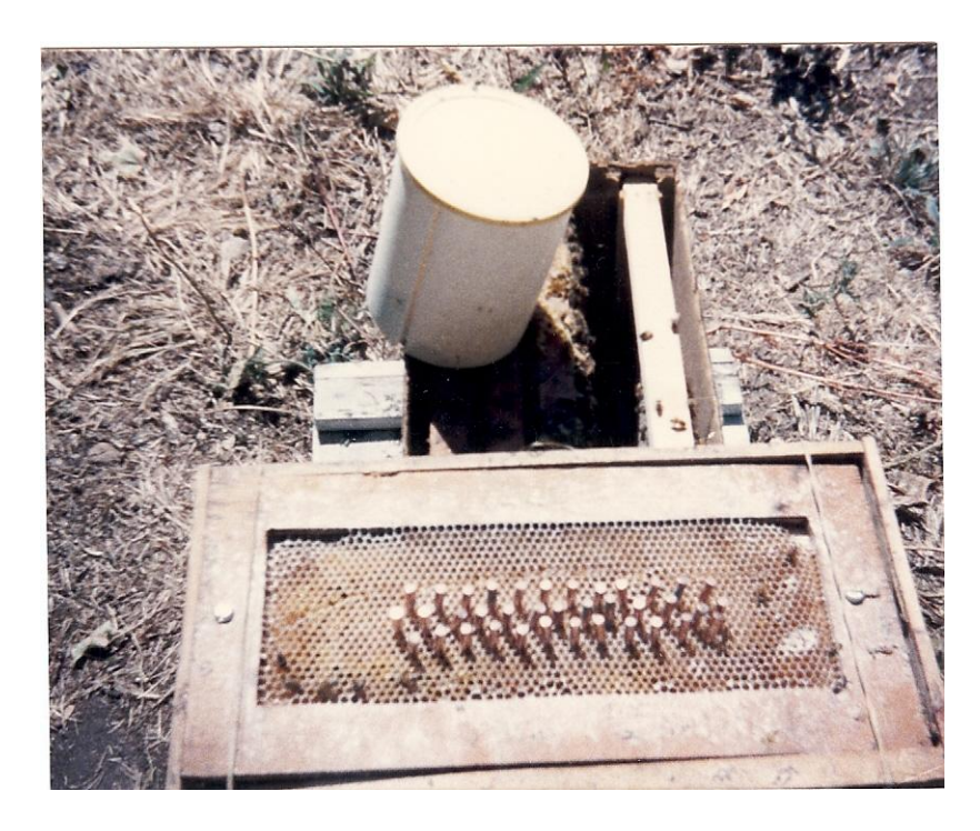
Figure 5: Bullets