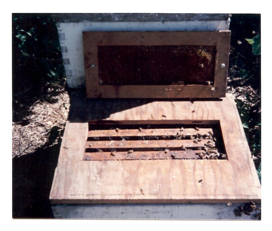
Figure 6: Inner cover for split-frame insert

Push in cages to confine the virgins in the incubator so they won't kill each other. Rectangular cage for the vertical frame and round cage for the horizontal frame insert. Use 1/8 inch hardware cloth. The round cage when used with a 5/8 inch plastic furniture leg tip can be pushed over the comb and give a twist to remove the cell, then put the plastic tip on the other end to introduce to a nuc the conventional way. This is an alternative to the incubator. Leave a little queen candy in these cages so the virgin can feed herself.