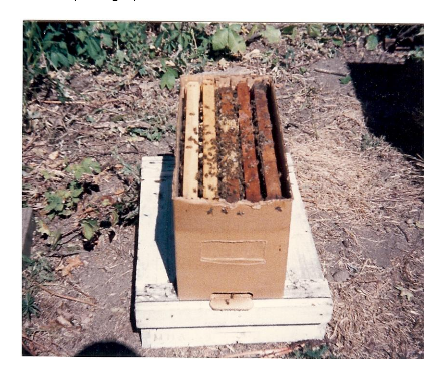
Figure 4: The Splitter Nuc Box

I use .257 cal. bullets placed in the cell to protect the larvae when flour is shaken over the comb to gum up and kill the other larvae (See Fig. 5).