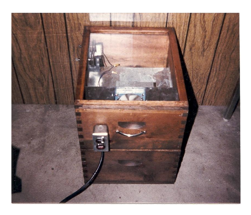
Figure 7: The Incubator