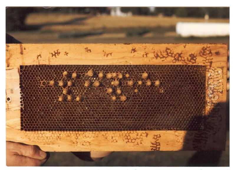
Figure 1: Case-Hopkins method on split frame insert. Twenty-four excellent cells.

In the Case-Hopkins method when I would put the frame insert horizontally on the cell builder they would rear queen cells wherever they wanted. This means that they would join them together and make it inconvenient for removal. When I smashed the comb leaving one row out of three there was a mess, especially if honey was in the comb. It was also difficult to use the comb over again. There had to be a better, faster, and neater way to kill larvae. After several experiments, I discovered that common wheat flour (the kind you use to bake or make a pollen supplement) will gum up the larvae making it impossible for the nurse bees to care for them. By covering every third cell with something to protect the larvae, such as bullets or cotton swabs, I could prepare a comb with larvae spaced just right. I can put 100 bullets on a comb in three minutes and then the shaking of the flour takes only 15 seconds. This proved to be fast, neat, and I could use the comb over again.