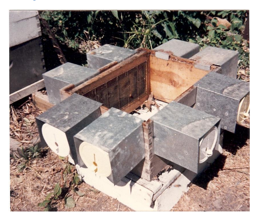
Figure 8: The International Mating Nuc